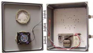
TESSCO Part Number: 310530 TerraWave Part Number: V141206L02HC 14"x12"x6" Polycarbonate Heated/Cooled Enclosure with Latch Locks

TerraWave's innovative Solution Technology Integrator (STI) program with Cisco allowed the trucking company to purchase Cisco Access Points (APs) pre-installed in TerraWave's 14"x12"x6" Polycarbonate Heated/Cooled Enclosures. The company ordered 150 enclosure and Cisco AP solutions. When the customer received the units, all the engineer had to do was mount each solution. In addition, TerraWave's broad line of products allowed the company to purchase a number of additional supplies for the project, including antennas and cable assemblies.