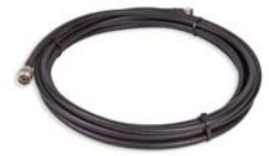
TESSCO Part Number: 322923 TerraWave Part Number: 400-01-02-P10' 10' TWS-400 Series Cable Assembly with RPTNC Plug to RPTNC Jack Connectors