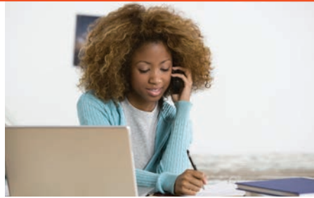
Student Centers/ Dorms