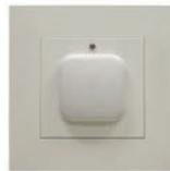
Indoor and Outdoor Enclosures