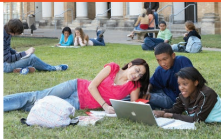
Outdoor Common Areas