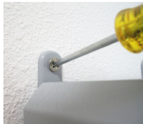
Mounting to Wall Figure 5