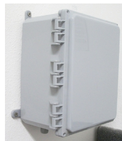
Mounted Solution Figure 6