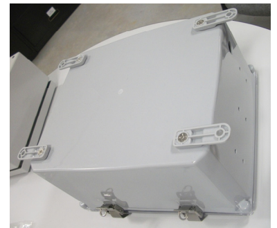
Finished Enclosure Figure 4