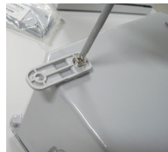
Horizontal Feet Figure 2