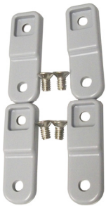
Mounting Feet Kit