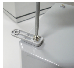
Vertical Feet Figure 3