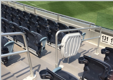
Handrail Enclosures were installed throughout the stadium