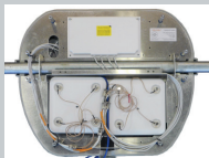
Stadium Handrail Enclosure for Cisco 3802e APs TESSCO No. 549590