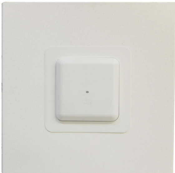
Front –the frame of the Ceiling Tile Bracket surrounds access point face for an aesthetically pleasing finish.

Ventev's robust Ceiling Tile Bracket is a simple, smart solution for mounting Cisco 2800i and 3800i access points in indoor environments with tile ceilings such as offices, classrooms and lecture halls, and industrial manufacturing facilities. The bracket secures the access point on the tile, and frames the front of the AP for an aesthetically pleasing finish that blends with the environment. All Ventev mounts are covered by the company's two-year TerraNet warranty. For questions and to purchase product, contact Ventev: 800.851.4965 or sales@ventev.com.