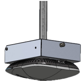
Shown with an Aruba AP