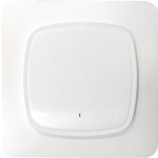
Front frame surrounding AP face