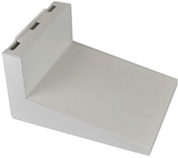
Right Angle Wall Bracket w Lid Tessco No. 521473