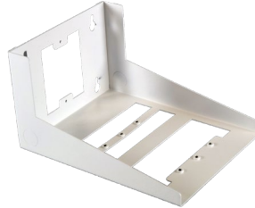
Right Angle Wall Bracket Tessco No. 538527