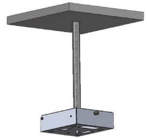
Hanging Conduit Mount Tessco No. 211234