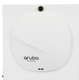
Aruba 335 Door Part #: V2-IDOOR-335 SKU: 290590