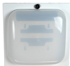
Clear AP Cover Door Part #: V2-IDOOR-12124C SKU: 215812