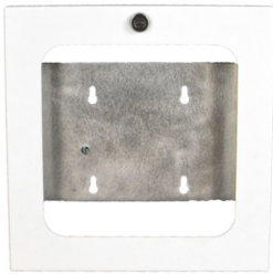
Cisco 4800 Door Part #: V2-IDOOR-4800 SKU: 271759

Ventev's Replaceable Doors for Interchangeable Door Hard Lid and V2 Ceiling Tile Enclosures are constructed of powder-coated aluminum and are designed to meet NEC300-22 and 300-23 standards for installation in plenum/air-handling areas. Every Ventev enclosure is covered by the company's two-year TerraNet warranty program. For questions or to purchase product, contact Ventev: 800-851-4965 or sales@ventev.com.