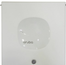
Aruba 303 Door Part #: V2-ID-303 SKU: 222857