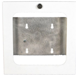
Cisco 3802 Door Part #: V2-IDOOR-3802 SKU: 237974