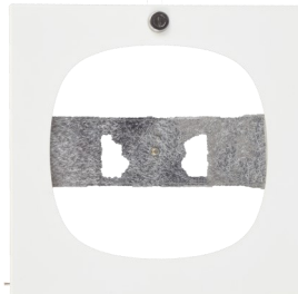
Aruba 325 Door Part #: V2-IDOOR-325 SKU: 283710