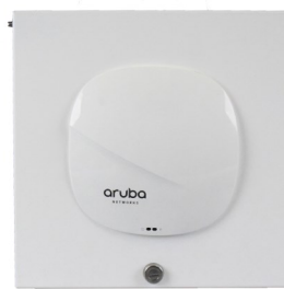
Aruba 315 Door Part #: V2-IDOOR-315 SKU: 250979