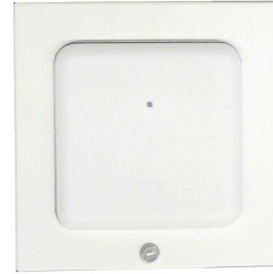
Cisco 1852i Door Part #: V2-ID-1852I SKU: 207978