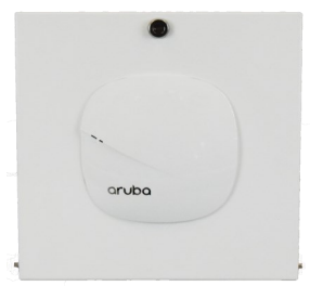
Aruba 305 Door Part #: V2-IDOOR-305 SKU: 206325