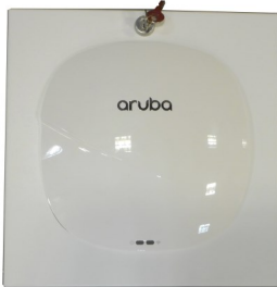
Aruba 345 Door Part #: V2-IDOOR-345 SKU: 297061