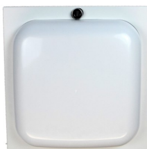
White AP Cover Door Part #: V2-IDOOR-12124W SKU: 252990