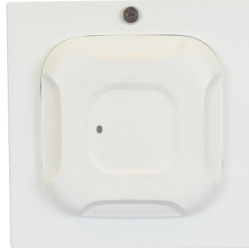
Cisco 3702 Door Part #: V2-IDOOR-3702 SKU: 294869