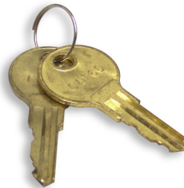
Keys included with enclosure