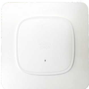
Front frame surrounding AP face