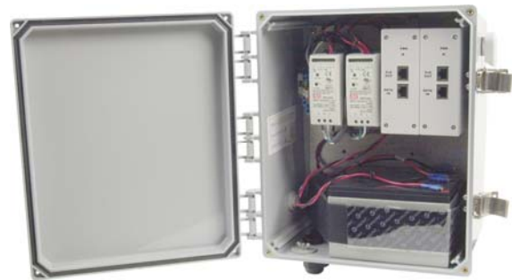
Double PoE+ Output SKU 556727

System includes power supply and charger, PoE injector, battery bank with strap, wire harness and RJ 45 feed-thrus