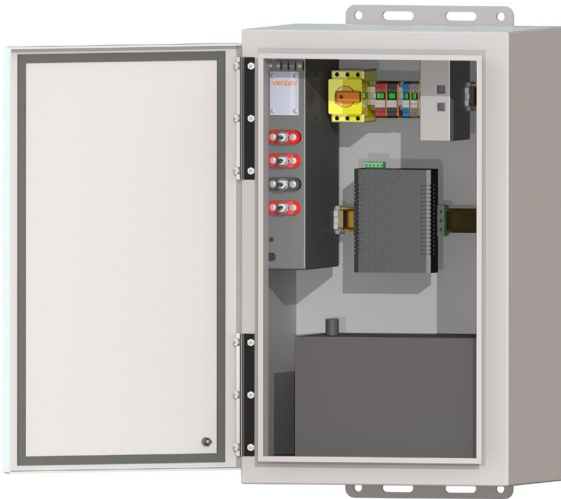
Multi-Port Power Extender for Light Poles TESSCO No. 200667