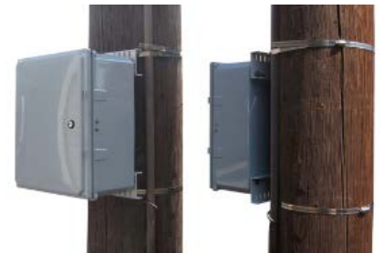
Polycarbonate enclosure mounted to large round wooden pole.