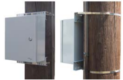
Steel enclosure mounted to large round wooden pole.