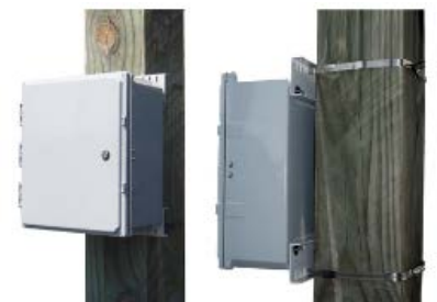
Polycarbonate enclosure mounted to large square wooden pole.

All product specifications are subject to change without notice or obligation.