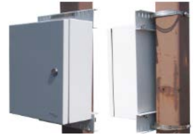
Steel enclosure mounted to small square steel pole.