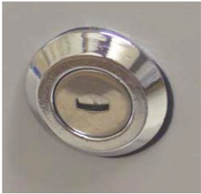
Enclosure Key Lock