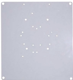
Universal Mounting Plate