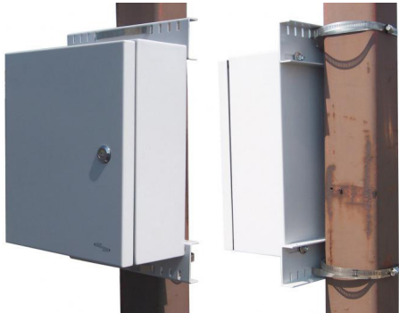
Flexible mounting options